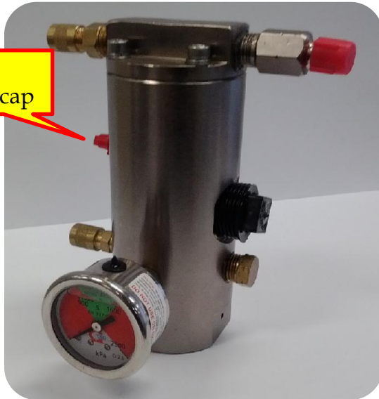
Part # QTB2012