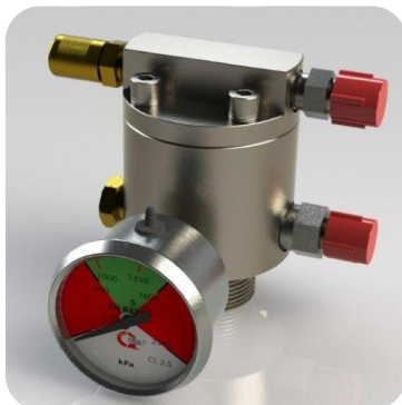
Part # QTB950MK4

This valve represents another step forward for Qtec with the same high quality, reliability and performance.